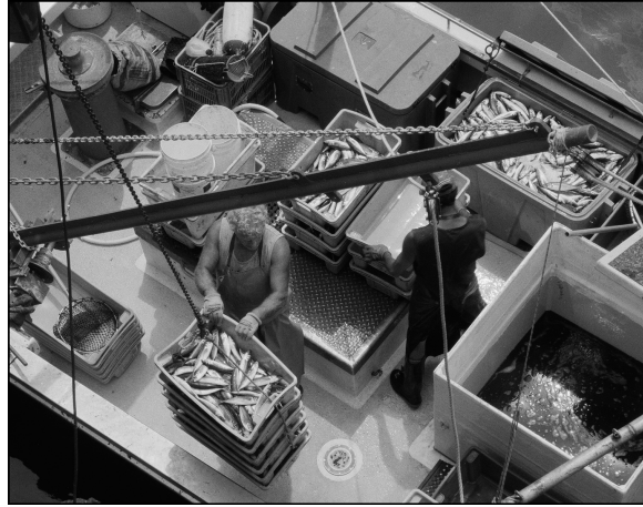
Unloading Fish