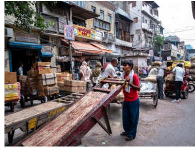
Busy workers in the streets, India Accepted Cheryl Thompson