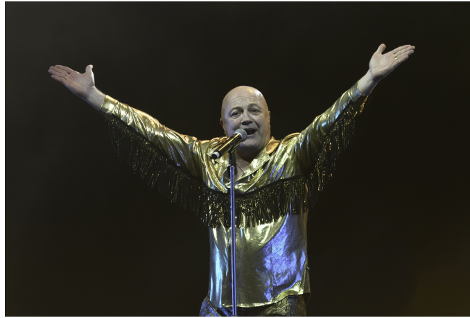
Working to get the crowd going