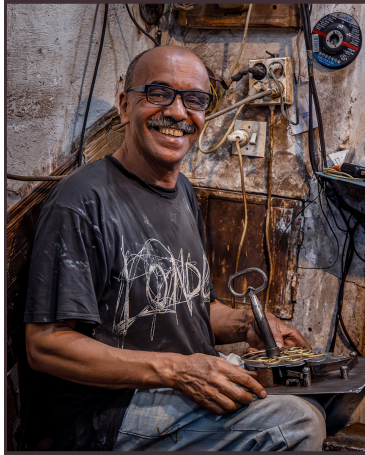
Lock Maker