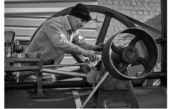
Mechanic at Work