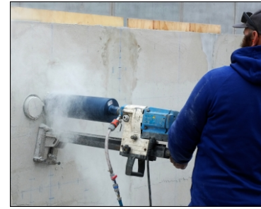
The Big Drill Accepted Effan Effans