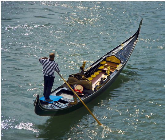
gondola 3