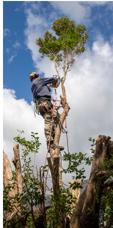
The Last Bit of tree Credit Ann Lamb