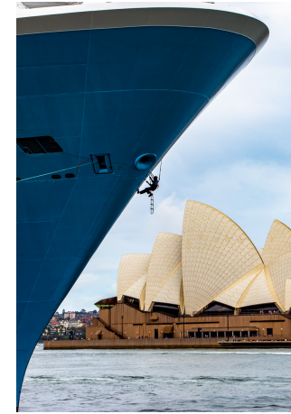
Keeping things ship-shape