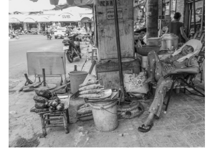
sleepingjpg Accepted greg delavere LAPS