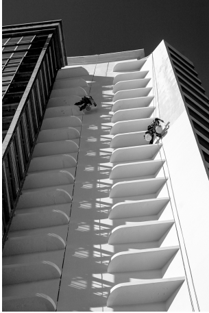
Painters at work