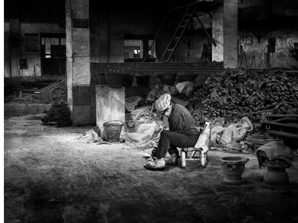
Its a Hard Life