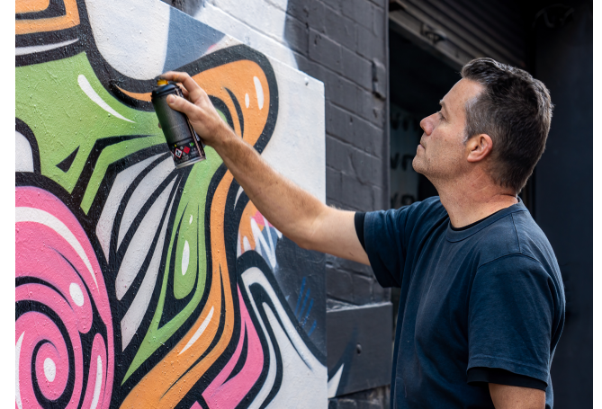
Graffiti Artist Profile