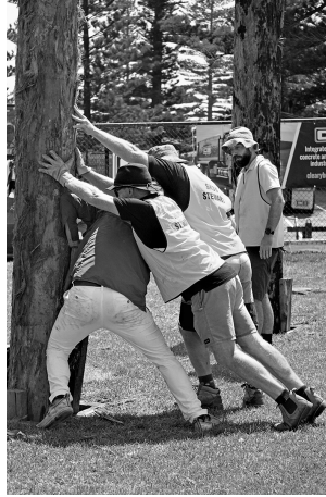
Is it straight yet