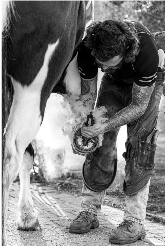
Farrier hot shoeing show horse