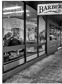
Cut It Out Accepted Bruce Shaw